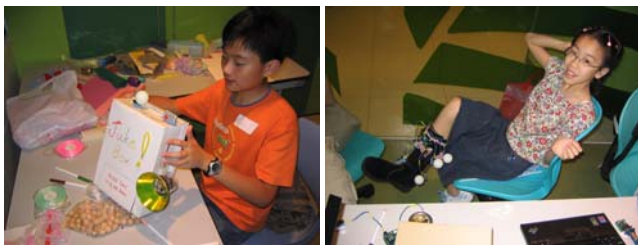
Figure 2: Projects from a Cricket workshop

As we develop new technologies for children, our hope is that children will continually surprise themselves (and surprise us too) as they explore the space of possibilities. When we created Crickets, we didn't imagine that children would use them to measure their speed on rollerblades, or to create a machine for polishing and buffing their fingernails. To support and encourage this diversity, we explicitly include elements and features that can be used in many different ways. The design challenge is to develop features specific enough so that children can quickly learn how to use them, but general enough so that children can continue to imagine new ways to use them [14].