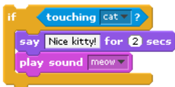
Figure 3: Scratch programming blocks

How can we use new technologies to integrate play, design, and learning? One way is to provide children with the opportunity to design their own games. In her book Minds in Play , Yasmin Kafai [7] documents how elementary-school students become more creative thinkers as they design their own games. More recently, my research group teamed up with Kafai to develop a new programming language, called Scratch ( http://scratch.mit.edu ), that enables children to create not only games but also interactive stories, animations, music, and art [13]. In designing Scratch, one of our key goals was “tinkerability” – that is, we wanted to make it easy for children to playfully put together fragments of computer programs, try them out, take them apart, and recombine them. To create programs in Scratch, you simply snap together graphical blocks, much like LEGO bricks or puzzle pieces (see Figure 3). You don’t need to worry about where to put semi-colons or square brackets: the blocks are designed to fit together only in ways that make sense, so there are no “syntax errors” as in traditional programming languages. You can even add new blocks as the program is running, so it is easy to “play with your code,” testing out new ideas incrementally and iteratively.